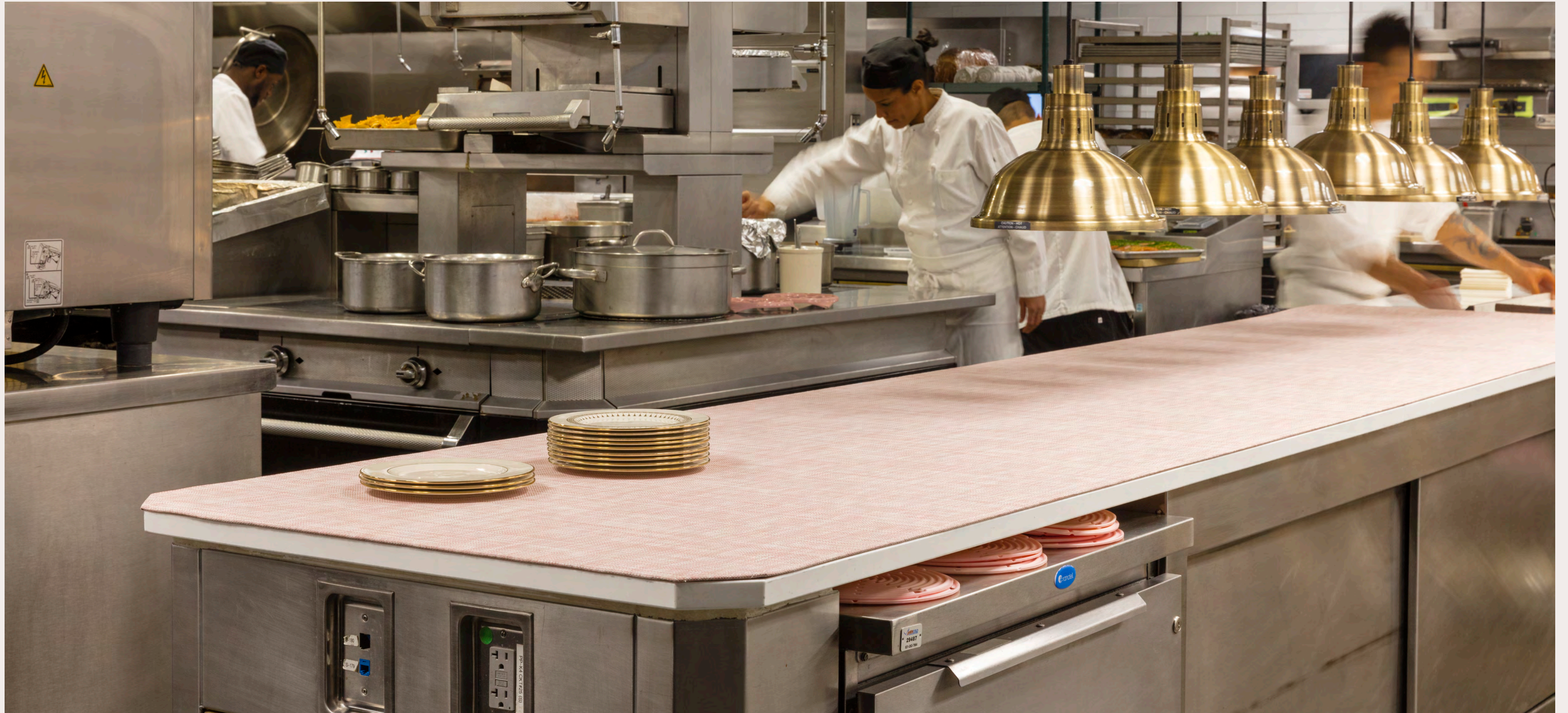
BLUSH, Mini Basketweave Worktop. The Grill, New York, NY.