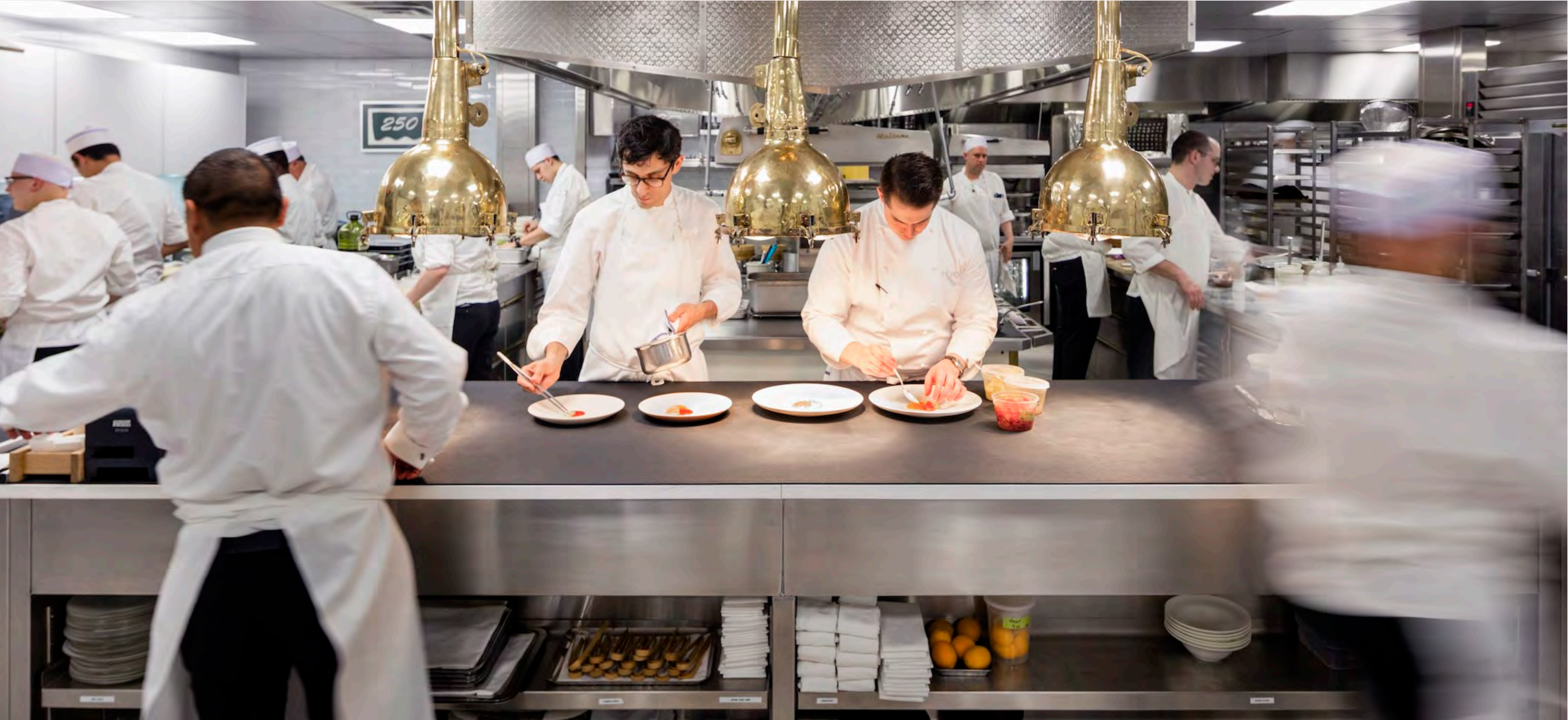
BLACK, Mini Basketweave Worktop. The Pool, NYC.