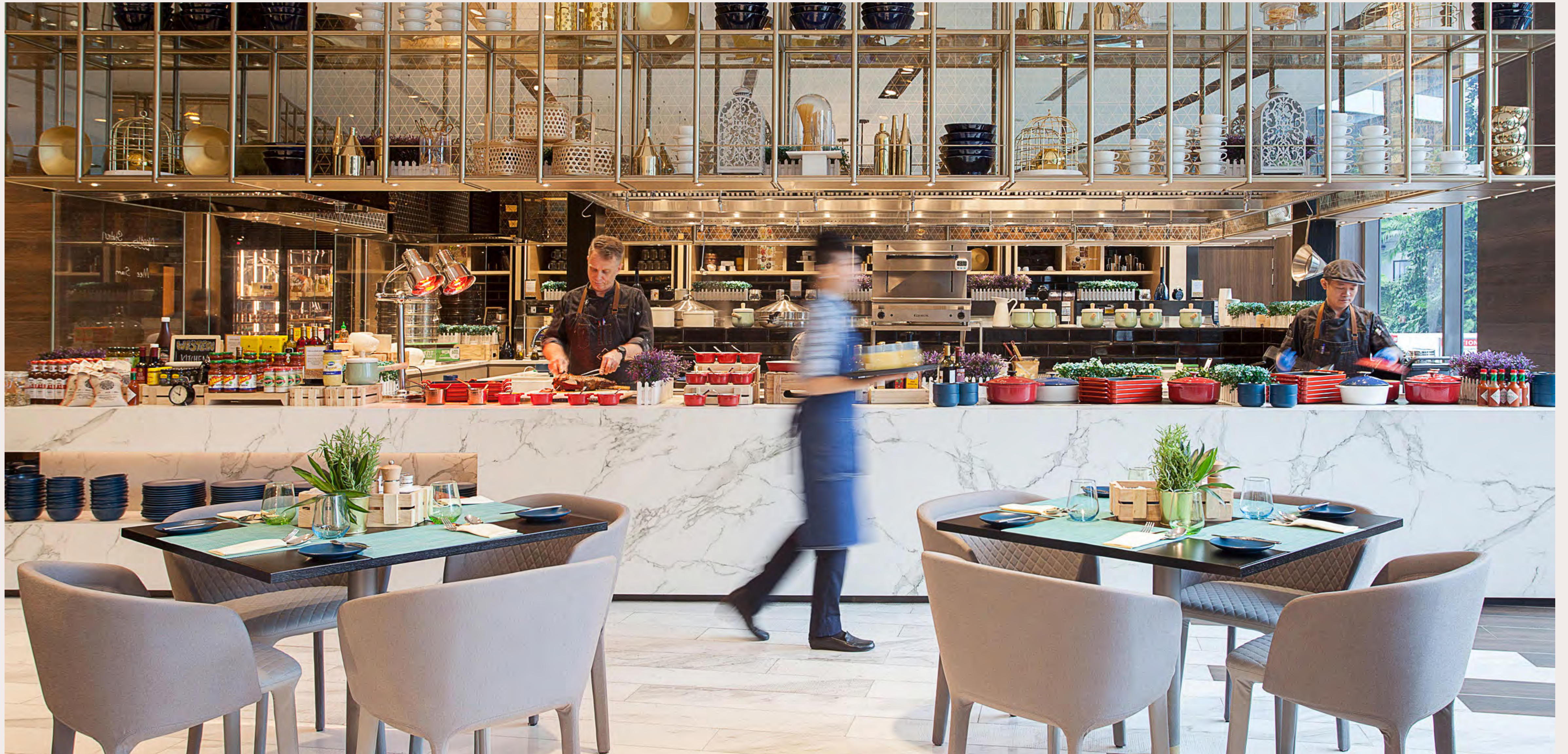
Food Exchange Restaurant, Novotel Singapore on Stevens Hotel