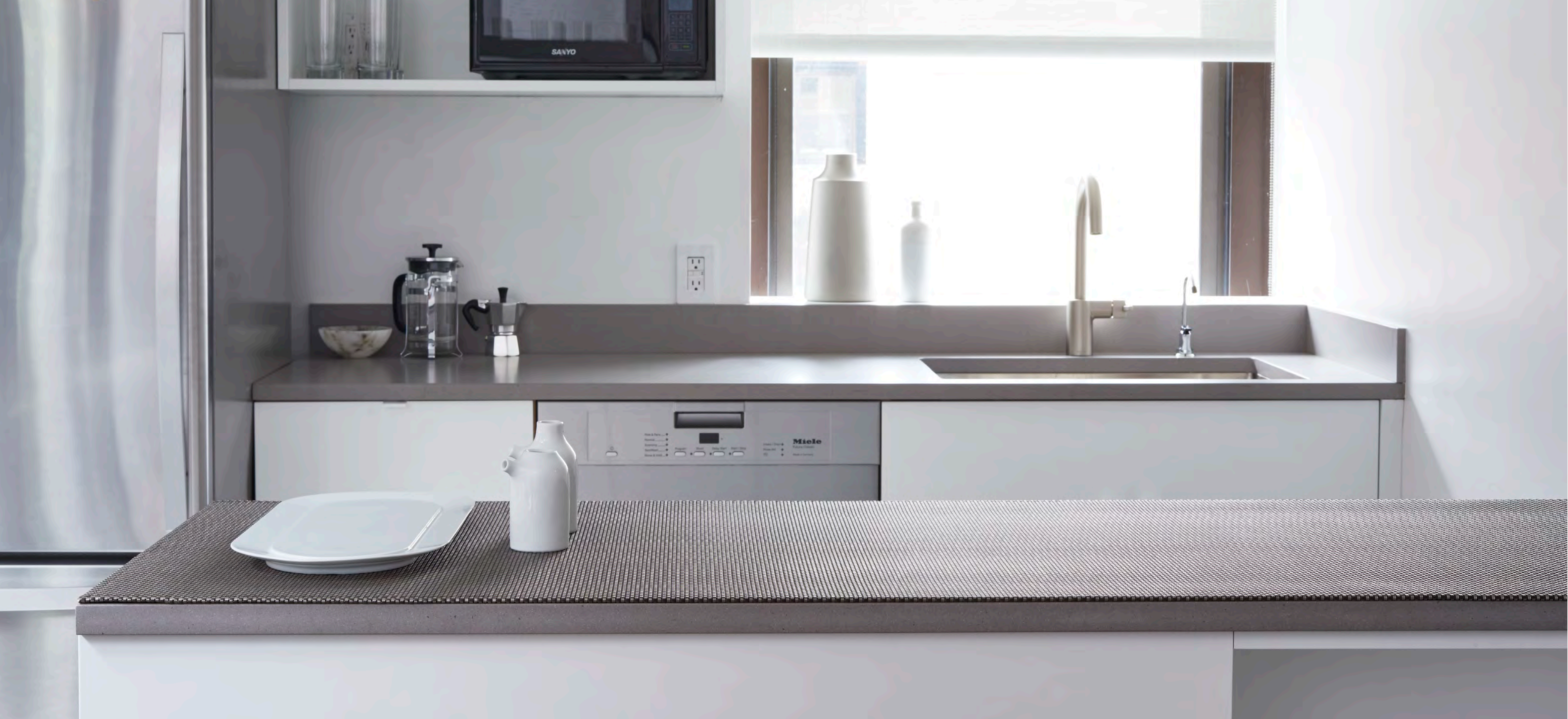
TITANIUM, Basketweave. Corporate kitchen.