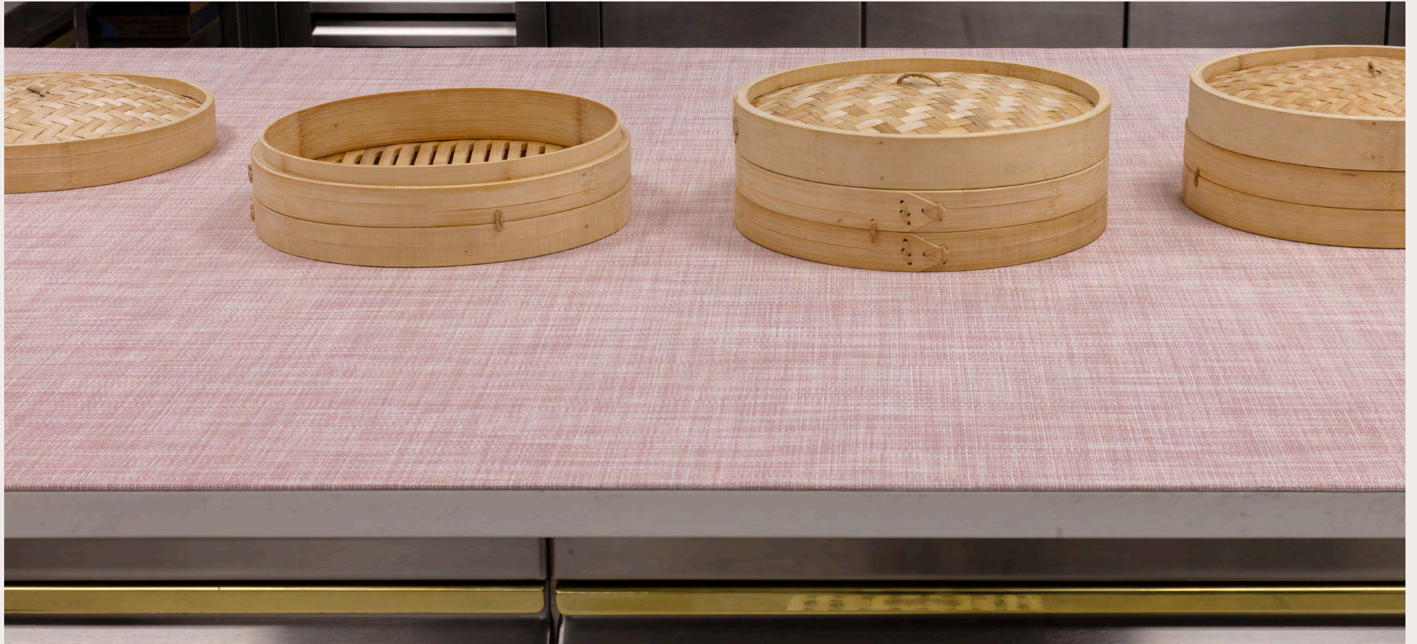
BLUSH, Mini Basketweave Worktop. The Grill, New York, NY.