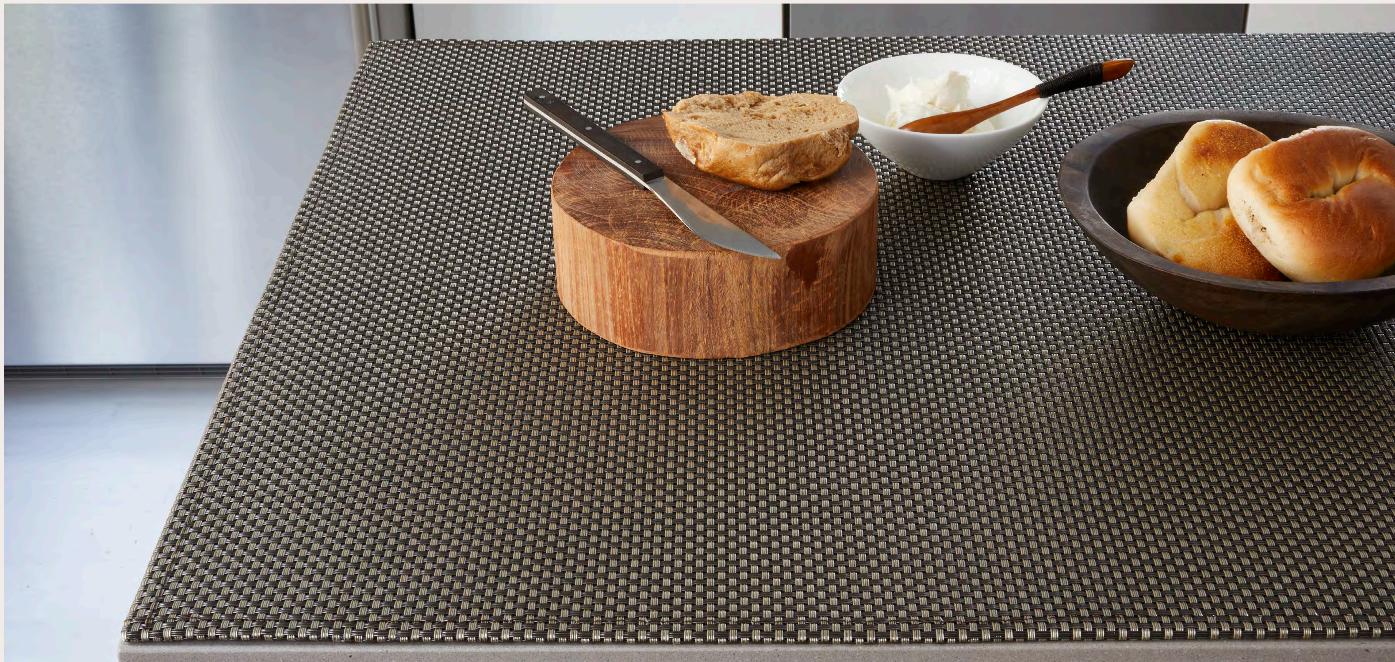
TITANIUM, Basketweave. Corporate kitchen.